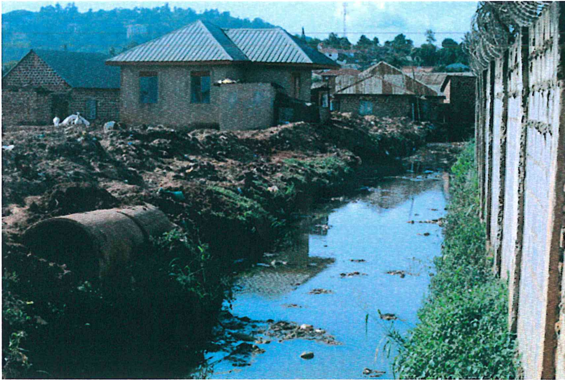
Photo 4. Fresh debris being added to the wetland banks waste in Bugolobi – Kitintale swamp, Kampala – Uganda. Photo taken on 17 th May, 2023.