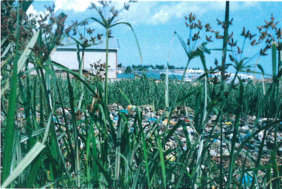
Photo1. A section of the wetland used as a dumping site for household refuses. Majority of this is plastic waste in Bugoloobi - Kitintale swamp, Kampala – Uganda. Photo taken on 17 th May, 2023.