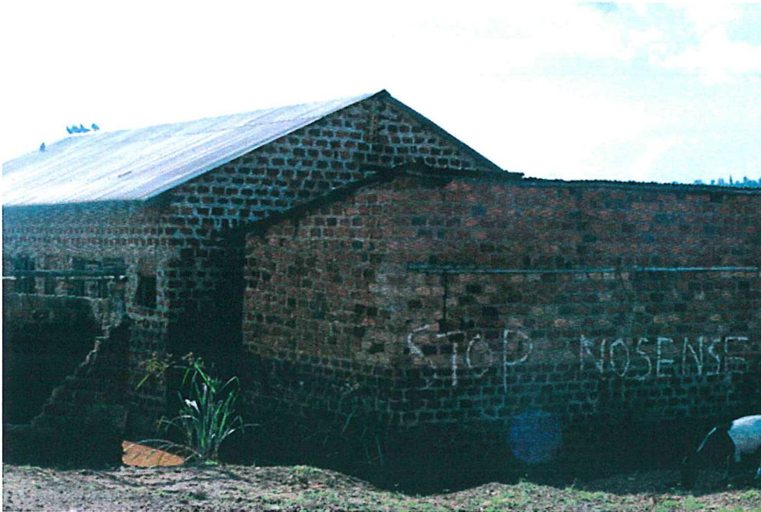
Photo3. Informal settlement recently flooded by water in Bugoloobi - Kitintale swamp, Kampala - Uganda. Photo taken on 17 th May, 2023.

Photo2. A new heap of soil recently added to a wetland to provide room for expansion for industrialization waste in Bugoloobi - Kitintale swamp, Kampala - Uganda. Photo taken on 17 th May, 2023.