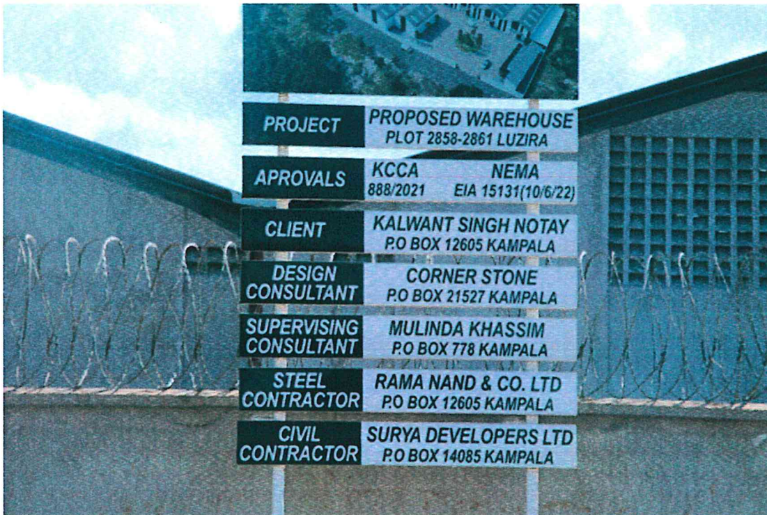
Photo5. A proposed warehouse belonging to Kulwant Singh Notay in the wetland with alleged KCCA and NEMA approvals in the heart of the wetland further increasing the flooding in this area in Bugolobi - Kitintale swamp, Kampala – Uganda. Photo taken on 17 th May, 2023.