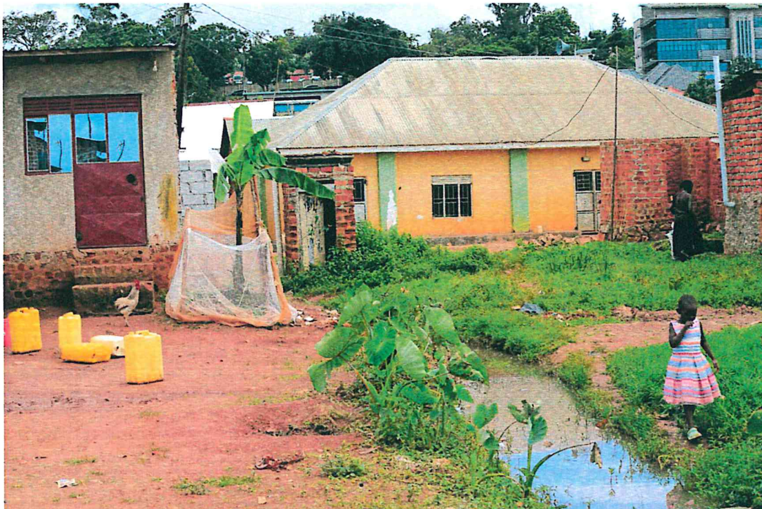
A young girl walking around open trench, leading water to the wetland in Kirombe - Butabika - Kampala, Uganda; on Tuesday, 9th May, 2023.