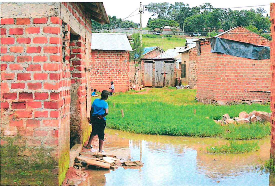
Kids stuck inside and around a flooded homestead, one looking at fellows playing in Kirombe - Butabika – Kampala, Uganda on Tuesday, 9th May, 2023.