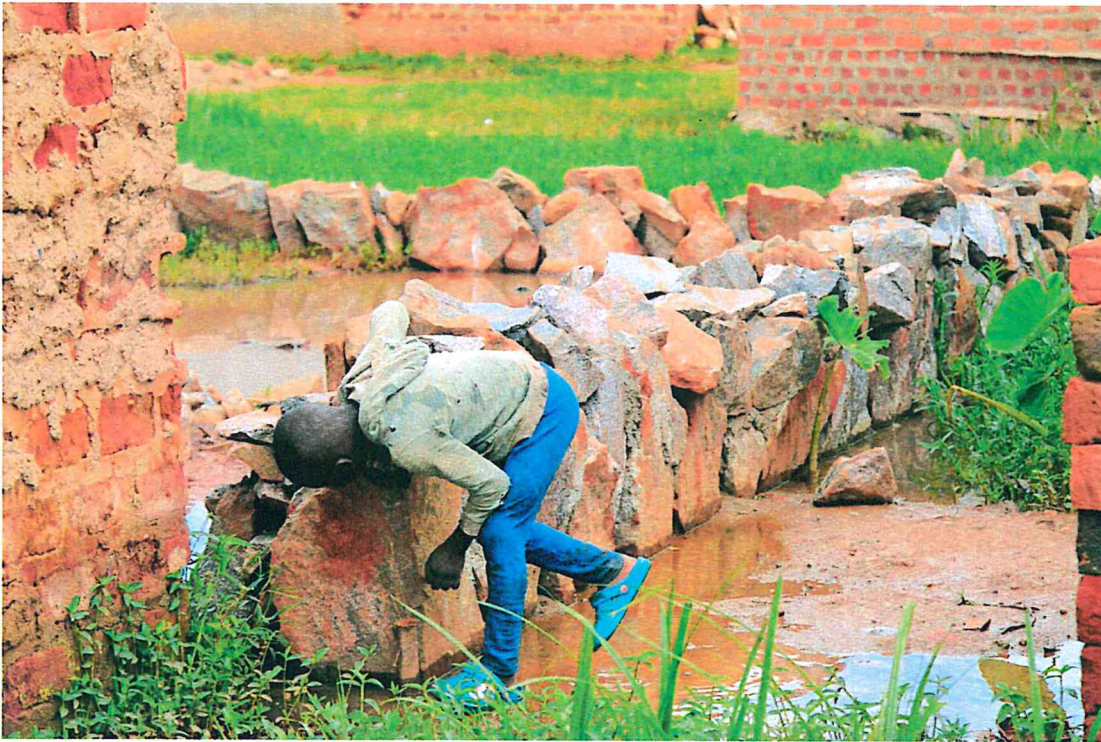
A Young boy playing around a newly made foundation in a wetland at Kirombe - Butabika – Kampala, Uganda on 9th May, 2023.