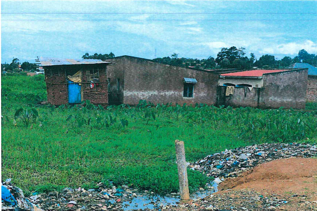
Plastic pollution and informal settlement in the wetland in Kirombe - Butabika - Kampala, Uganda photographed on Tuesday, 9th May, 2023.