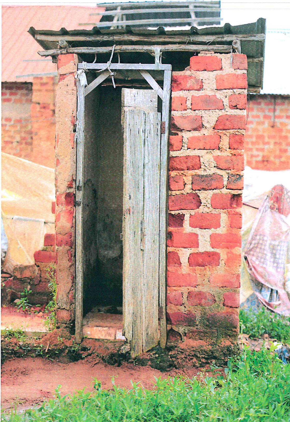
Sanitation in informal settlement in a wetland, human waste mixes with water of the wetland in Kiroombe - Butabika - Kampala, Uganda. Documentation done on Tuesday, 9th May, 2023.